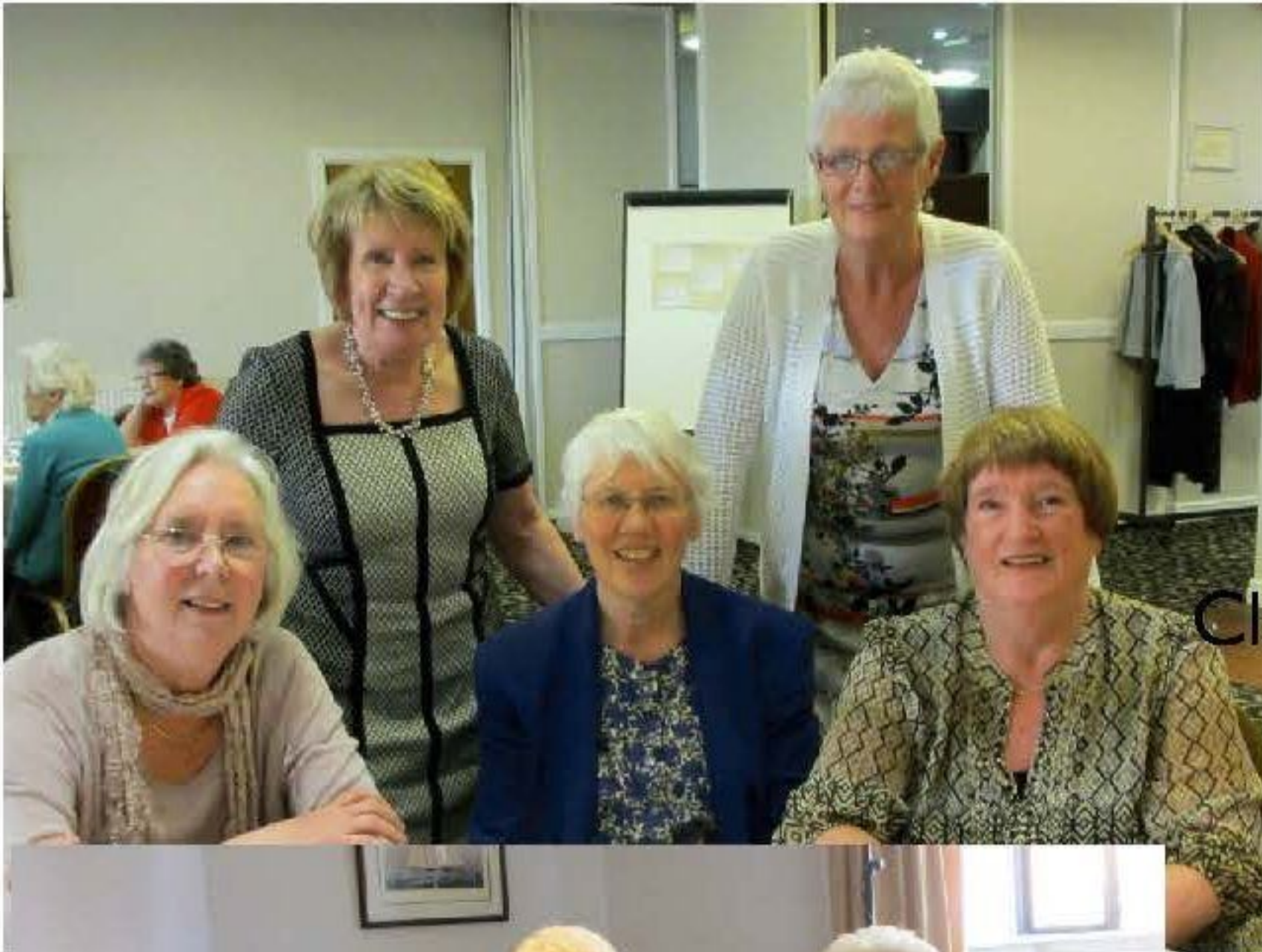
Some photos from the Annual lunch at the Sea Hotel, South Shields on 24th April 2015