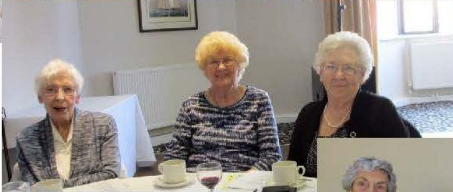
Class of 58